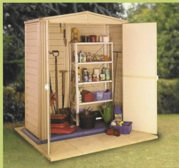
'The Little Hut' - 5'3" at front x 2'9" at sides. Also available in 5'3" x 5'3" (The Large Hut) i.e. twice the depth of 'The Little Hut'. Both models feature strong, moulded integral floor in which the walls sit.