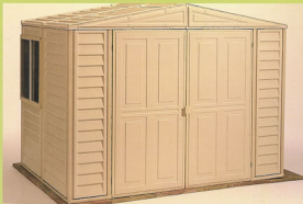
'DuraMate' - 94" at front x 63" at sides / Ridge Height = 73" / Eaves height = 63". Door Opening: 63" height x 61" width