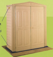
'Little Hut' - 63 1/4" at front x 32 1/4" at sides / Ridge Height = 79 1/4" / Eaves height = 71 1/4". Door Opening: 71 1/4" height x 52 1/2" width

Ventilation Kit Two included with each shed for you to fit