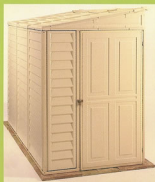
'SideMate' 47 1/2" at front x 94" at sides / Ridge Height = 72" / Eaves height = 63 1/2". Door Opening: 63" height x 30" width