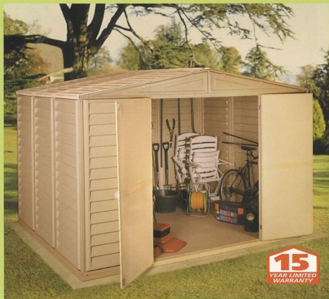
'The WoodBridge' - 10' at front x 8' at sides. Also available in 10' x 10' and and 10' x 13'.