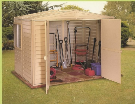
'The DuraMate' - 8' at front x 5'3" at sides. Also available in 8' x 7'10". Picture illustrates the optional window kit which fits all sheds.