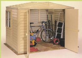
'DuraMate' - 94" at front x 63" at sides / Ridge Height = 73" / Eaves height = 63". Door Opening: 63" height x 61" width

DuraMax is more than just a storage shed, the refined patented design of our sheds makes it perfect for an activity or hobby room, storage or tool shed, farm equipment or whatever else you can think of. Our storage sheds offer a contemporary design in neutral colours that will naturally blend in with any backyard or garden.