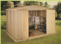
'WoodBridge' - 125" at front x 94" at sides / Ridge Height = 85" / Eaves height = 73". Door Opening: 72" height x 61" width

Ventilation Kit Two included with each shed for you to fit