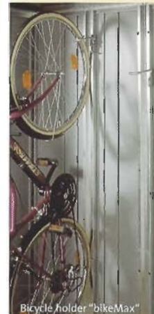
Bicycle holder "bikeMax"