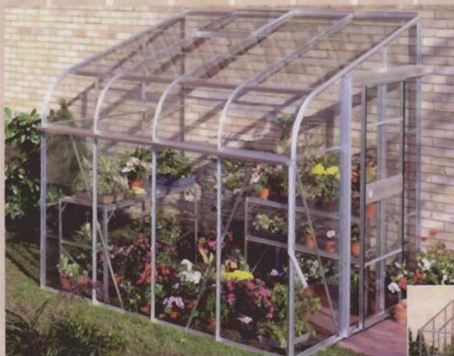
Model 86 Silverline