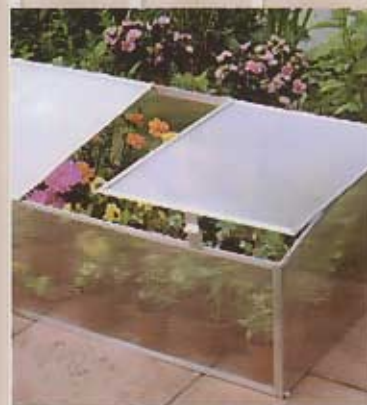
Model Poly 32