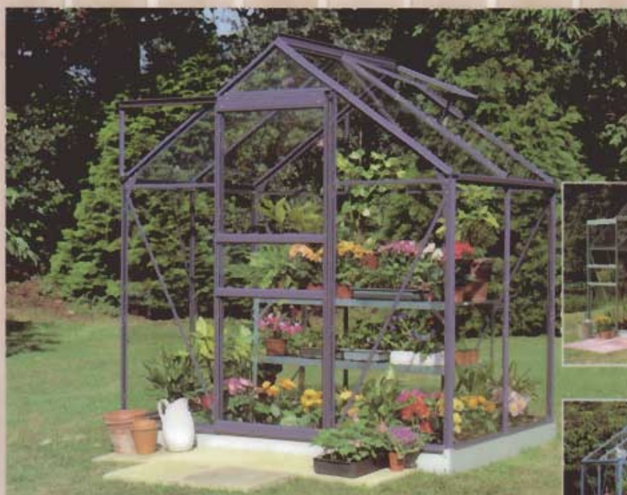
Model 46 Aubergine