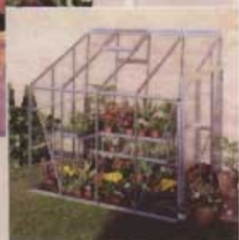
Model 86 Traditional