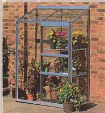
Model Wall Garden 42